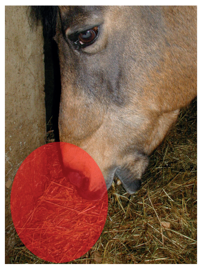
Figure 1. Illustration of the breathing zone of a horse.