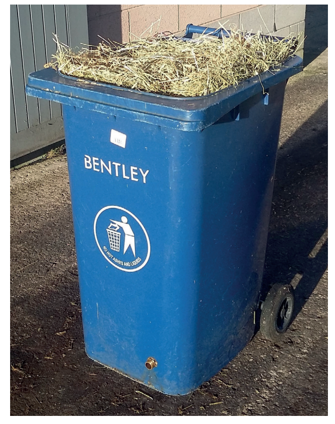
Figure 2. A converted bin used for soaking a bale (or less) of hay. Note the brass drainage hole bottom right.

es such methods are insufficient to cause clinical remission, due to a failure to reduce allergen load, with this only being achieved by a switch to haylage (Dixon et al, 1995a; 1995b). A disadvantage of feeding haylage is that for horses with obesity and related problems, its feeding will often be inappropriate (Carslake et al, 2018).